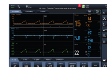
Waveform measurement tool