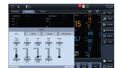
Automatic alarm limit

Benefit from the intuitive UI design of V3, it only takes two steps to adjust ventilation parameters. The functional layout is clinically applicable, and what you think is what you get.